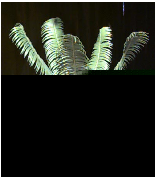
Figure 3. The donor Microcycas plant remains in good health.

In the Fall of 1997, I began to work with leaves of Microcycas calocoma applying what I had learned