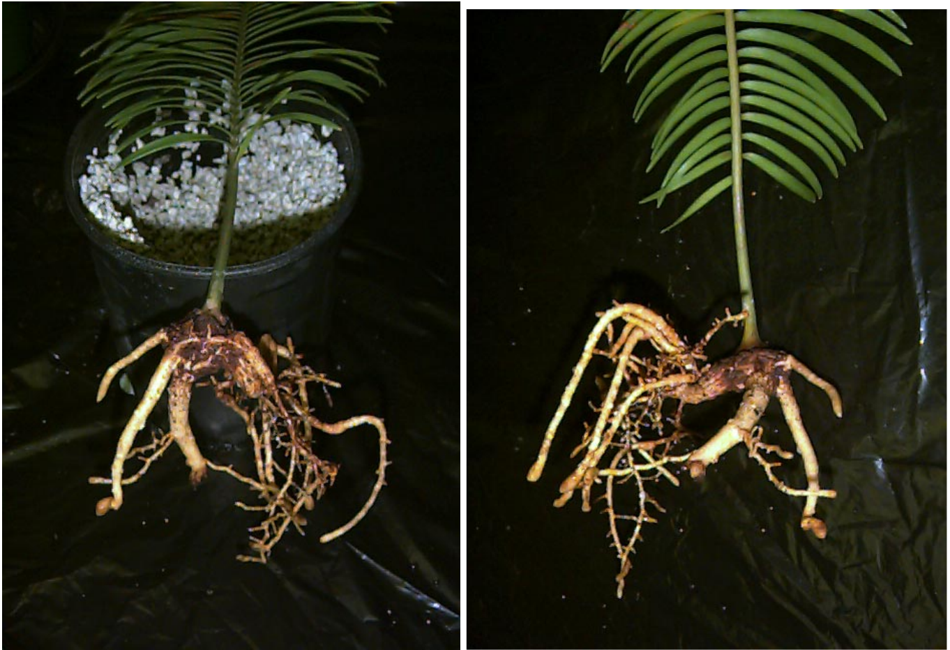
Figure 11. Two views of the roots of the Microcycas cutting shown in Figure 4. Photo at left shows the still expanding callus area (note cracks). This cutting is 18 months old.