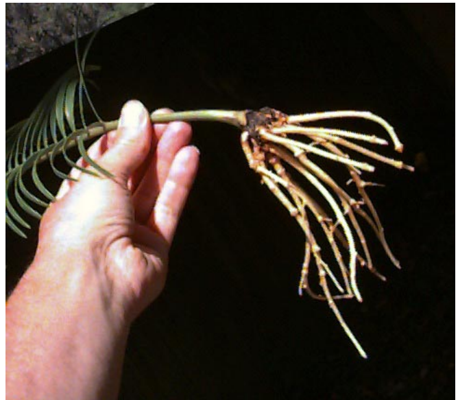
Figure 9. Root development (left) in a Microcycas cutting after 4 months in mist tank and (right) a cutting after 4 months in a mist tank and 3 months in the Aerojet unit (shown below).