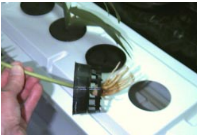
Figure 10. A Microcycas cutting being moved into the Aerojet unit.