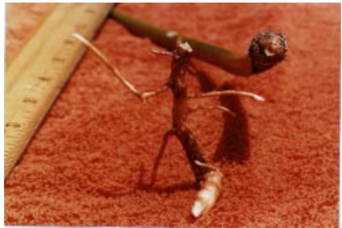
Figure 7. This root of this cutting has broken away from base of the leaf. Callus tissue was unusually small in this cutting. This 2 year old leaf of D. spinulosum was cultured for 7 months.

does not regenerate within the callus, the rooted leaf will never be more than a clonal “monster”. An extensive study was made of the structure and growth of the apical meristem (shoot apex) in Cycas (Foster, 1939). Sixty 2-year old Cycas revoluta seedlings were sectioned and examined microscopically to determine if there was a single “permanent” specific apical cell responsible for shoot growth. (A rooted