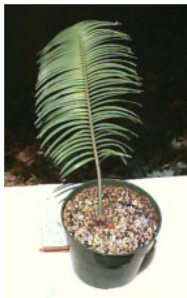
Figure 4. A rooted Microcycas leaf cutting potted in a mixture of pumice and sand

from the failures and near successes of past years. A mist tank was used to keep the leaf hydrated long enough to generate callus tissue and roots. I also switched from using orchid bark as the potting medium to sterilized sharp sand and pumice. Once the leaf cuttings had formed roots, I moved them into an Aerojet hydroponic unit that sprayed the suspended cuttings with nutrient solution every 5 minutes for 40 seconds. This caused more rapid root formation than would soil culture. This is important because the cutting has to develop a large callus mass and an extensive root system before the leaf reaches its natural senescence and began to die.