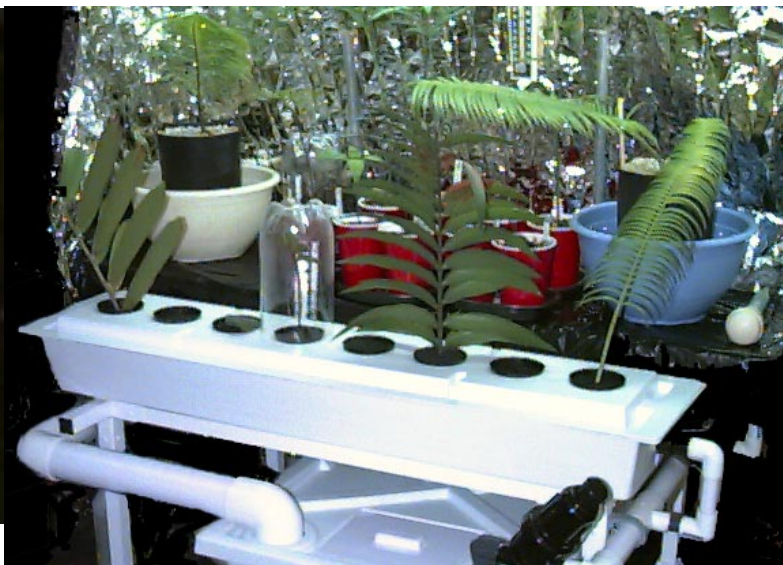
Figure 6. An Aerojet hydroponic unit available from seaofgreen.com , Phoenix, Arizona, U.S.A.