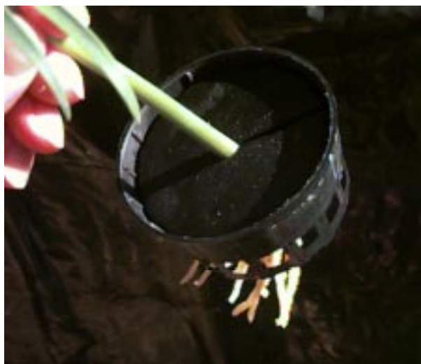
Figure 5. A rooted leaf cutting is placed through a hole in the pot's neoprene plug. This cutting is now ready for the Aerojet unit